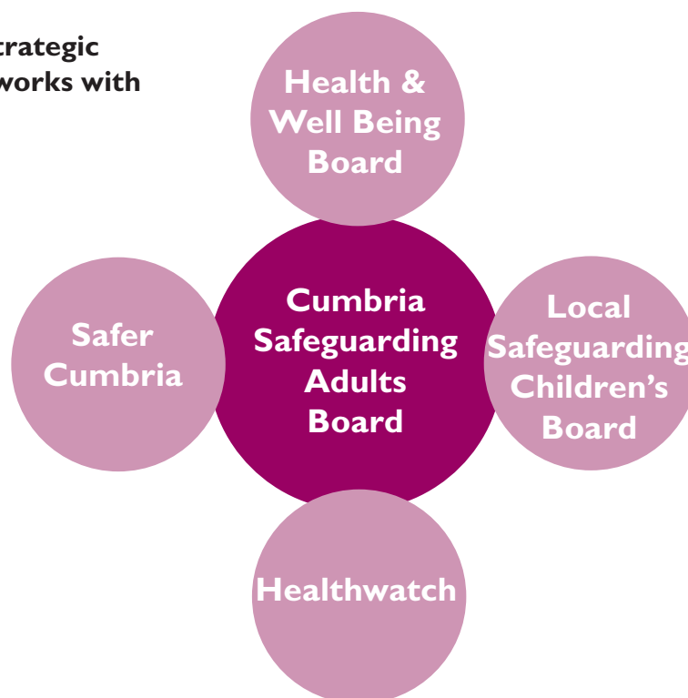
Diagram showing strategic boards that CSAB works with

The work of the Board is supported by the infrastructure of sub groups and a Business Manager who oversees and enables the delivery of this Plan, coordinating sub group work plans and regular reporting to the Board.